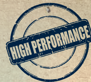
EXAMPLE OF PERFORMANCE TEST FOR AMBER PRODUCT (DEGREASER):

The Ecolabel licence means environment respect and effectiveness tested against market-leader products with same or higher dirt removal power.